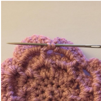
1 Catch the back of sc