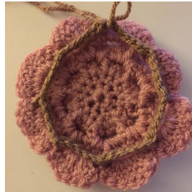
2 Eight chain spaces